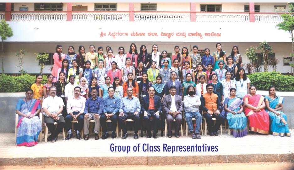
Group of Class Representatives