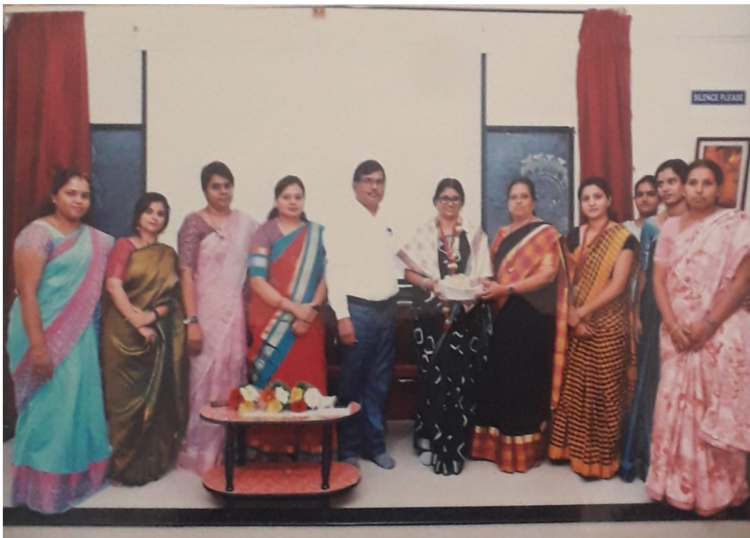
Honour to the Resource person