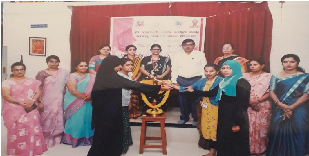
Inauguration by Dignitaries