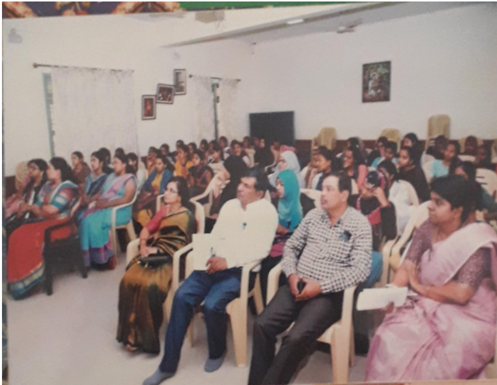
Students Present at Seminar Hall