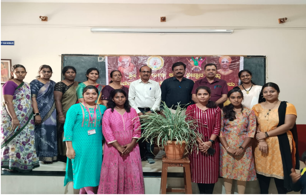
Inauguration by Dignitaries